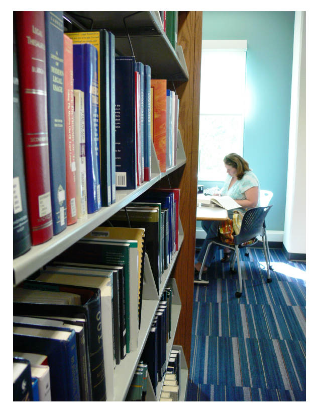
A student takes advantage of the comfortable seating and print materials in the commons. The Hammes Information Commons has over 10,000 print materials and seating for nearly 100 people.