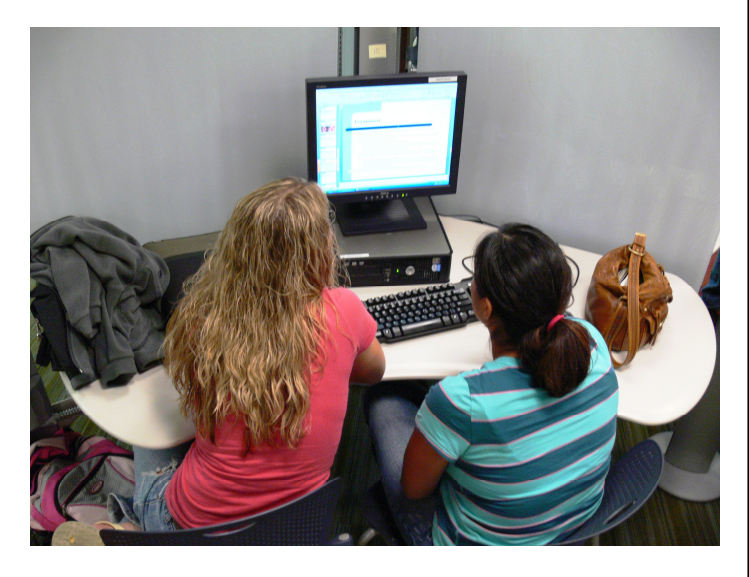
Students enjoy the collaborative computer workspaces, which allow them to work on group technology projects.